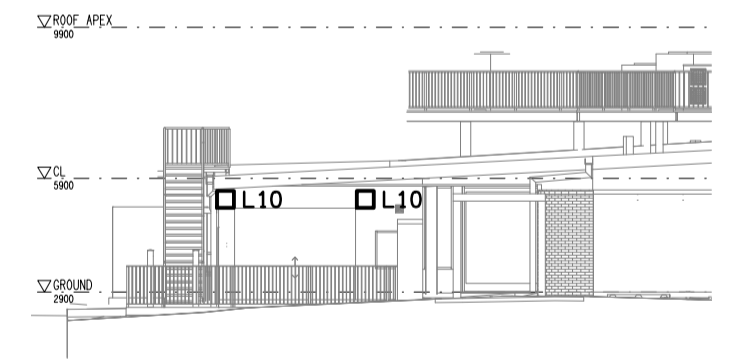
SOUTH EXTERNAL BUILDING ELEVATION SCALE 1:200